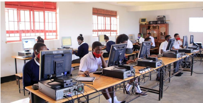
Computers for schools